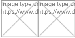
Image type unknown https://www.donmilanimontichiari.gov.it/files/progetti/progetti.pdf

Published on I.I.S. 'DON MILANI' MONTICHIARI (BS) ( https://www.donmilanimontichiari.gov.it )